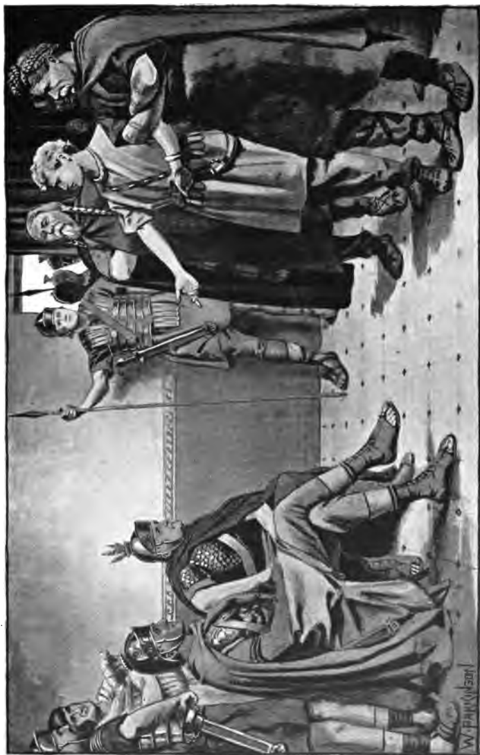
THE BRITONS BEFORE THE PROPÆTOR